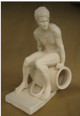
Crouching Nude , 2011 Patinated Ceramic 16 × 13 × 22 in.

Inspired by stories passed down by village elders, the Potter (above) stands barefoot in the classical contrapposto position. The majority of his weight is on his left leg leaving his right leg relaxed and slightly bent. The potter's right hand rests casually on his thigh. A tray, which potters used to bring their work to and from the kiln, is balanced across his left hand and shoulder. It holds typical Japanese tableware such as a choko (small cup) and kabin (vase). The figure's feet, cap, and pottery are glazed a deep green. High cheekbones protrude from his narrow face. The pronounced tendons in the figure's feet along with his rigid muscles are evidence of years of labor.