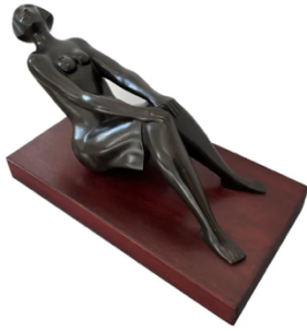
Elizabeth Catlett (1915 – 2012) Mahalia , 2002 Bronze with Brown Patina on Wood Base 14 x 29 x 11 ½ in. (35.6 x 73.7 x 29.2 cm)