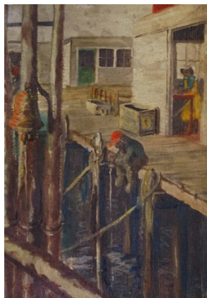
William Edouard Scott (1884–1964) On the Pier Oil on Canvas Laid Down on Board 12 \frac{1}{8} x 8 \frac{1}{2} in. (30.8 x 21.6 cm)