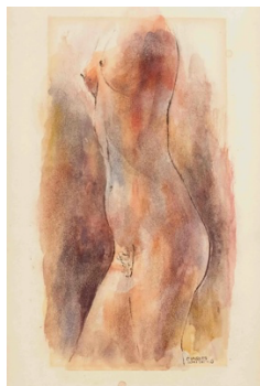
Charles White (1918-1979) Nude , 1965 Watercolor on Crescent Illustration Board 13 7/8 x 8 in. (35.2 x 20.3 cm)