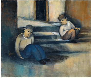
Charles Sebree (1914 –1985) Two Figures in an Alleyway , 1938 Oil on Masonite 20 x 24 in. (50.8 x 61 cm)