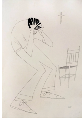
Benny Andrews (1930 – 2006) Pain of Sin , 1994 Pen and Ink on Cream Wove Paper 22 x 15 in. (55.9 x 38.1 cm)