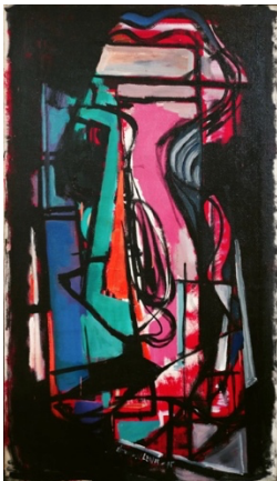
Norman Lewis (1909 – 1979) Title Unknown , 1945 Oil on Canvas 29 ¼ x 16 in. (74.3 x 40.6 cm)