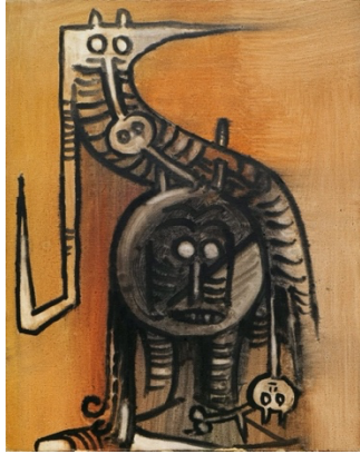
Wifredo Lam (1902 – 1982) Untitled , 1973 Oil on Canvas 17 ⅞ x 13 ¾ in. (45.4 x 34.9 cm)