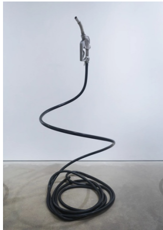
Willie Cole (1955 –) Gas Snake , 1992 Gas Pump Nozzle, Rubber Hose, and Rebar 64 x 26 ¾ x 31 in. (162.6 x 67.9 x 78.7 cm)