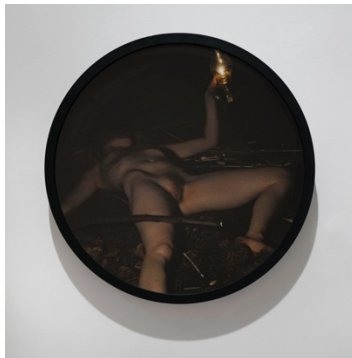
Carrie Mae Weems (1953- ) The Broken, See Duchamp , 2012 Chromogenic Print in Artist's Frame Edition of 3 Diameter: 21 1/2 in. (54.6 cm)