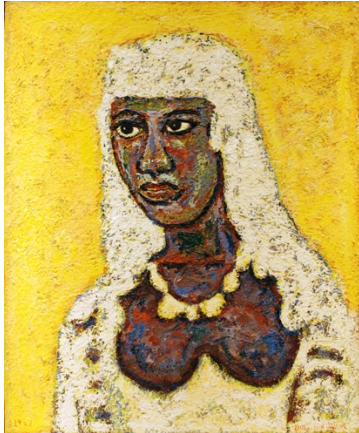
Beauford Delaney (1901 – 1979) Untitled , 1964-65 Oil on Canvas 25 x 21 in. (63.5 x 53.3 cm)