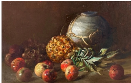
Charles Ethan Porter (1847–1923) Still Life with Pineapple, Jar, and Apples , ca. 1870s Oil on Canvas 14 x 22 \frac{1}{4} in. (35.6 x 56.5 cm)