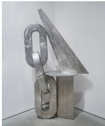
Melvin Edwards (1937 –) Culture , 1988 Welded Stainless Steel 61 x 37 x 18 in. (155 x 94 x 45.7 cm)