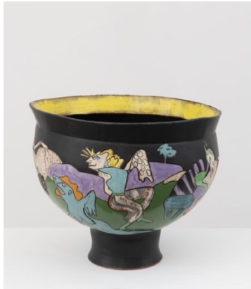
Camille Billops (1933 – 2019) Title Unknown , 1993 Ceramic 14 ½ x 17 ½ x 17 ½ in. (36.8 x 44.5 x 44.5 cm)