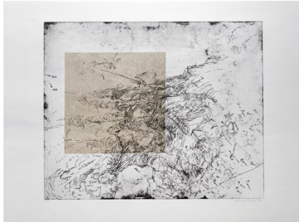
Howardena Pindell (1943 –) Untitled , 1998 Lithograph on Paper Edition of 20 Image: 17 \frac{1}{2} x 21 \frac{3}{8} in. (44.5 x 54.3 cm) Paper: 22 \frac{1}{8} x 29 \frac{1}{2} in. (56.2 x 74.9 cm)