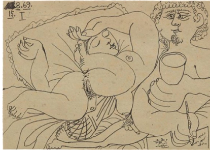
Pablo Picasso (1885 –1973) Nu Couche Et Homme Ecrivant ( Sleeping Nude and Man Writing ) 15 August 1969 Ink on Paper 8 \frac{5}{8} x 12 \frac{1}{4} in. (21.9 x 31.1 cm)