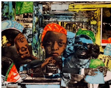
Romare Bearden (1911 – 1988) The Train , 1974 Aquatint Etching and Photoengraving with Hand Coloring on Paper From an AP Edition of 20 Image: 17 x 22 in. (43.1 x 55.9 cm) Paper: 22 x 30 in. (55.9 x 76.2 cm)