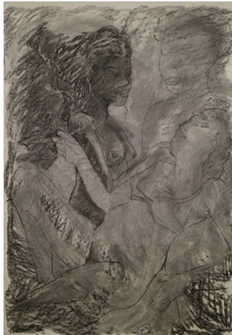
Robert Colescott (1925 – 2009) Ladies In Waiting , 1986 Charcoal on Paper 61 ⅛ x 42 ¼ in. (155.3 x 107.3 cm)