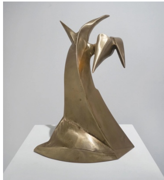
Richard Hunt (1935 – 2023) Model For Flight Forms , 2003 Cast and Welded Bronze 17 1/8 x 11 3/4 x 13 7/8 in. (43.5 x 29.8 x 35.2 cm)