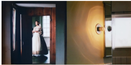
Lorna Simpson (1960- ) Corridor Bulb , 2003 Chromogenic Print, Mounted to Plexiglass Edition of 5 20 x 40 1/8 in. (50.8 x 101.9 cm)